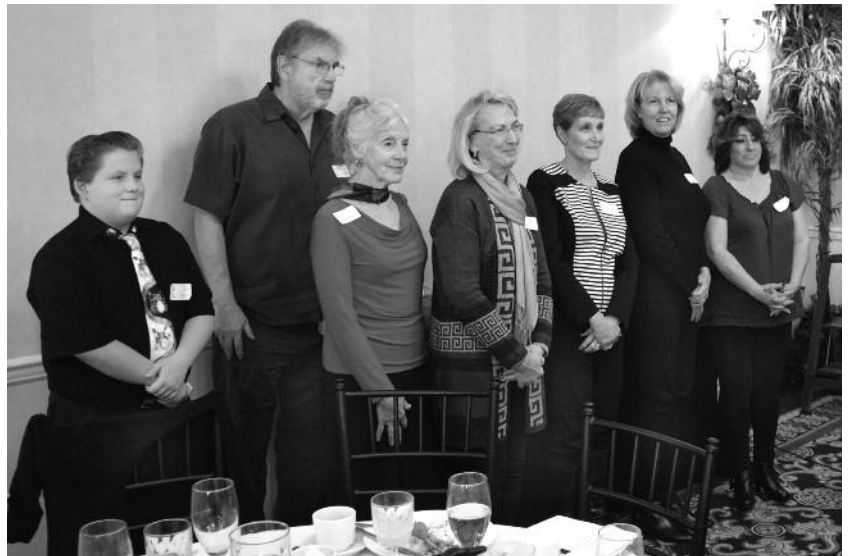
New Volunteers @ CTBL

Congratulations to each of these volunteers who make it possible for us to provide the best service to our patrons every day! Thank you!