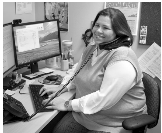
A Reader Advisor talks with CTBL patron on the phone.

Remember, if you are having any problems with your service or the type of books you are receiving, call 303-727-9277 or 800-685-2136 and ask for a Reader Advisor. They are always happy to help you adjust your account to get materials you will enjoy or to make suggestions for new titles for you to read. If you prefer, email your questions and comments to ctbl.info@cde.state.co.us . We love to hear from you!