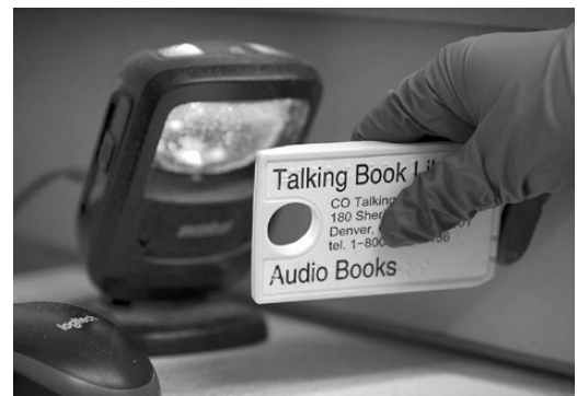
An audio book cartridge being scanned before being mailed to a CTBL patron.